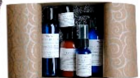
open with sacred wrapping paper in abundance of lavender flowers